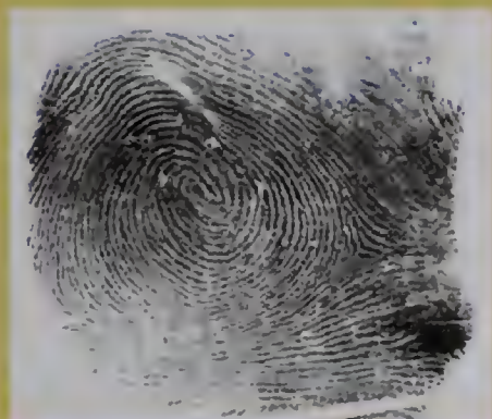
Print using Live Scan